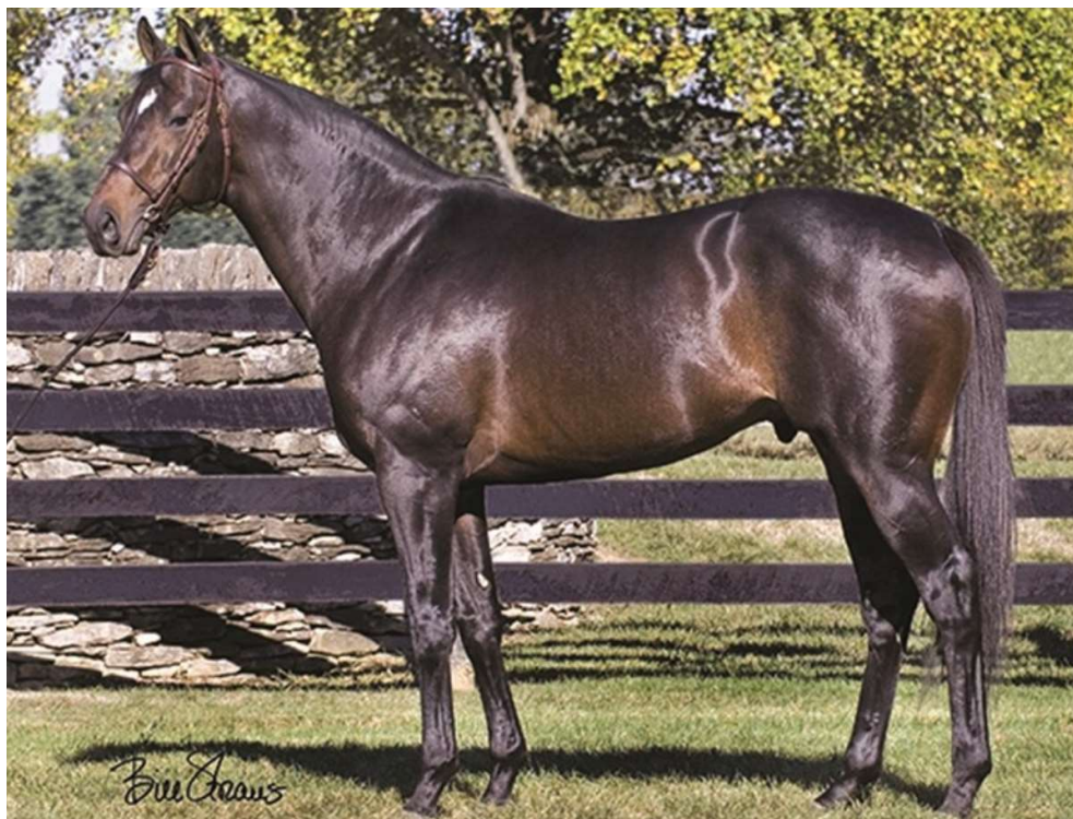
G1 Winner Orientate, Sire of Whyyouask